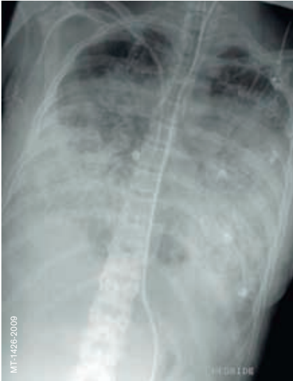
Both lungs indicate a confluent infiltrate, pointing to ARDS.