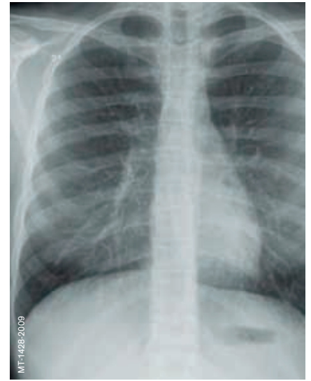
Two weeks after the initial lung x-ray, things have returned to normal.